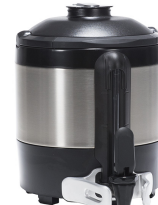
TF SERVER, 1G MECH NOBASE GEN3