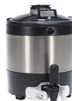
TF SERVER, 1G DSG NOBASE GEN3