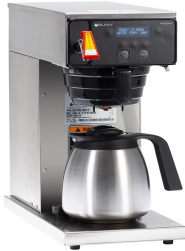
AXIOM-DV-TC, PF SST HOUSING