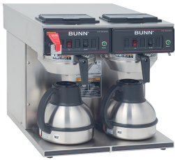
CWTF TWIN-TC, 120/240V SF