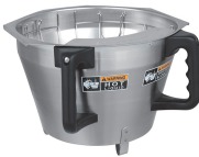
FUNNEL ASSY W/ BASKET, TITAN